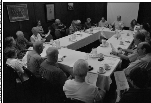
AGM 23rd October 2010 at Irish Club.